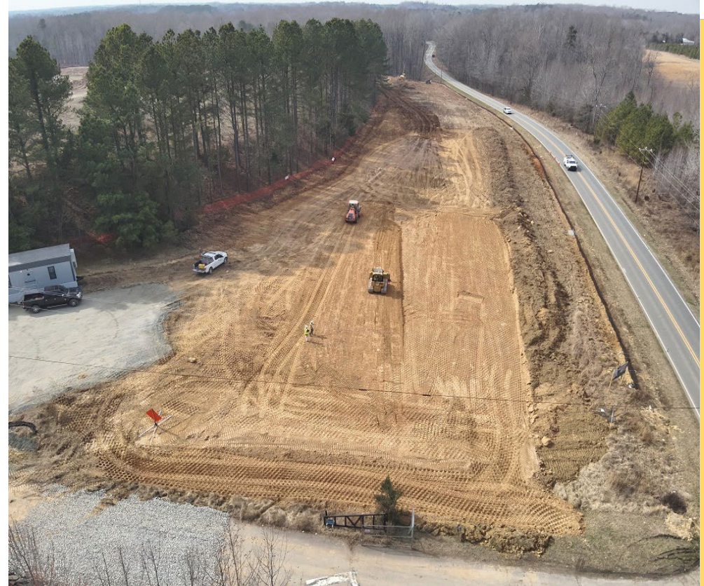
Administration/Classroom Building location February 2024