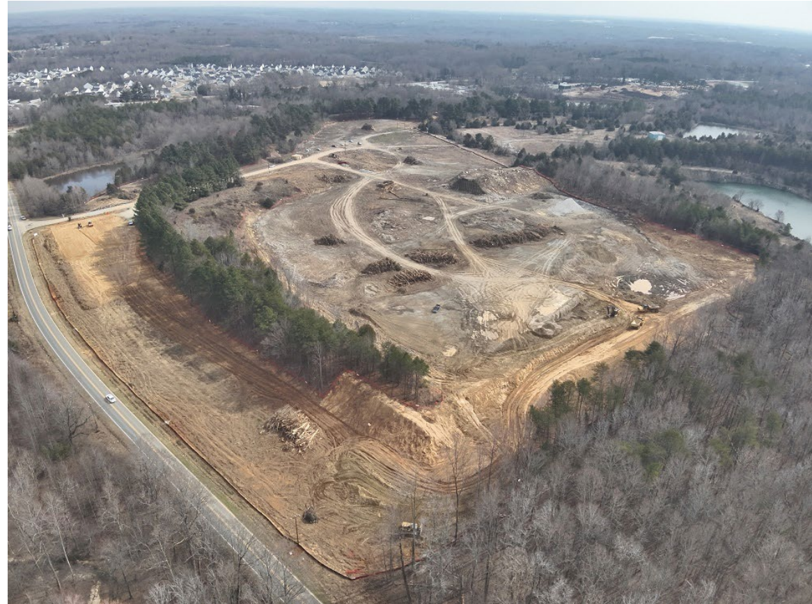
Overall Training Center Site February 2024