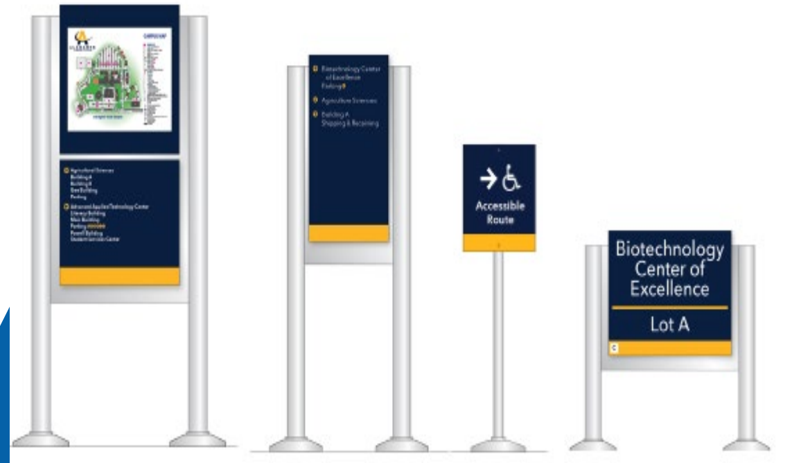
Exterior Signage Renderings