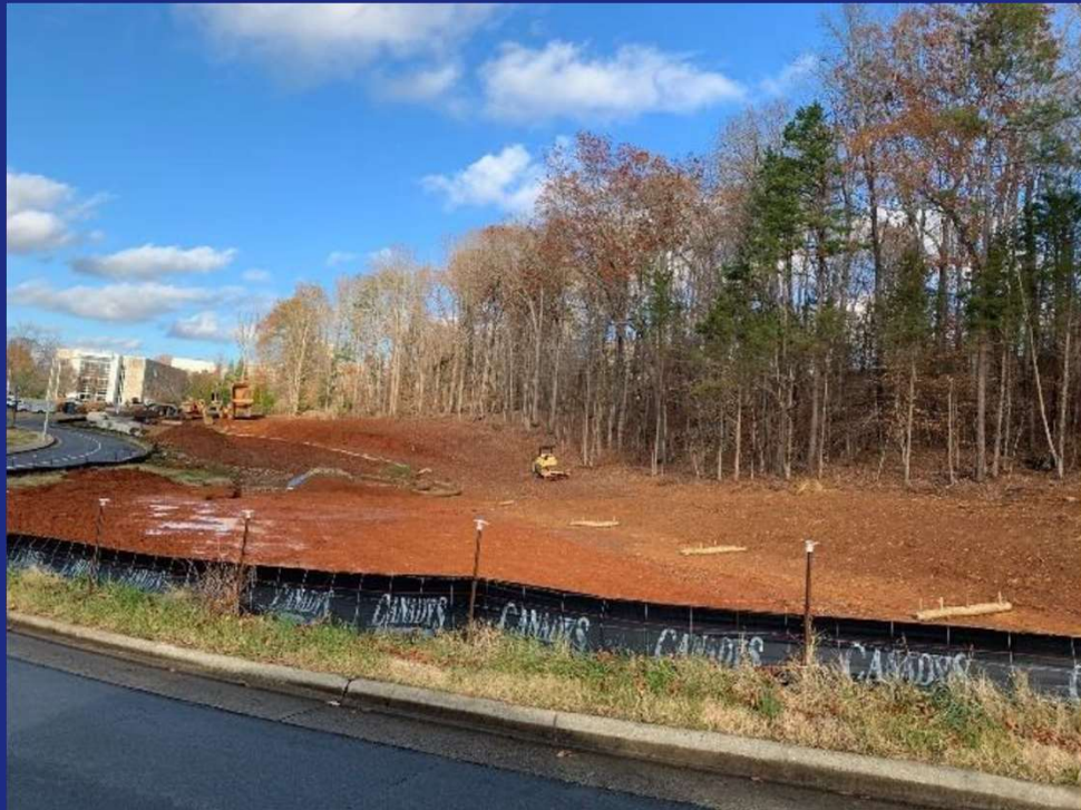
Grading of new remote parking lot