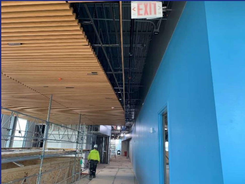
Third floor wood slat ceiling