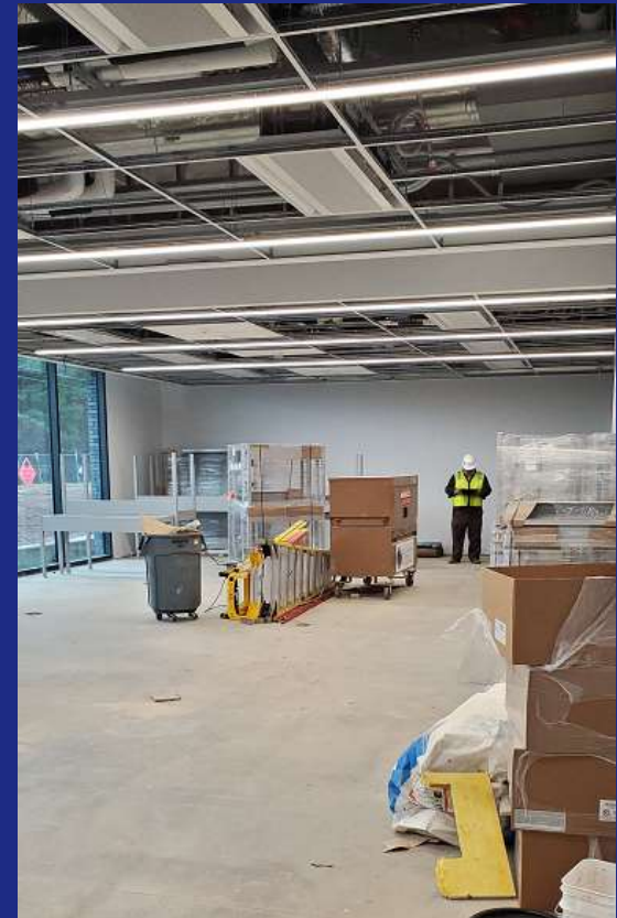
First floor double classroom