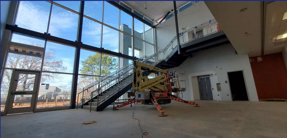
Lower level multipurpose/flex space