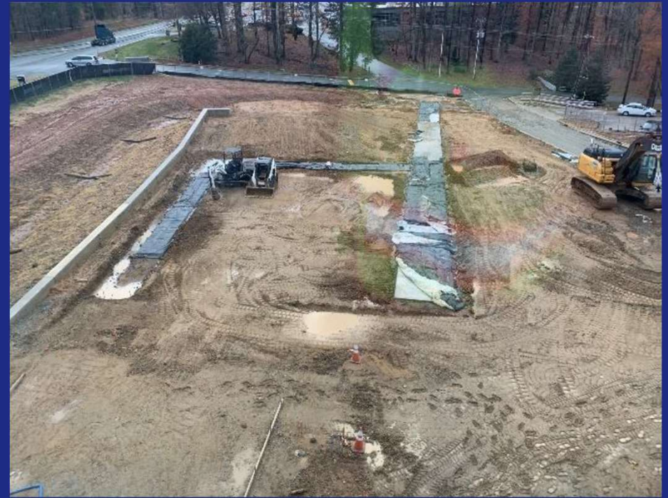
Install of sidewalks at southern end