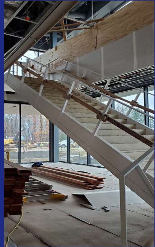
Main stairway from lobby