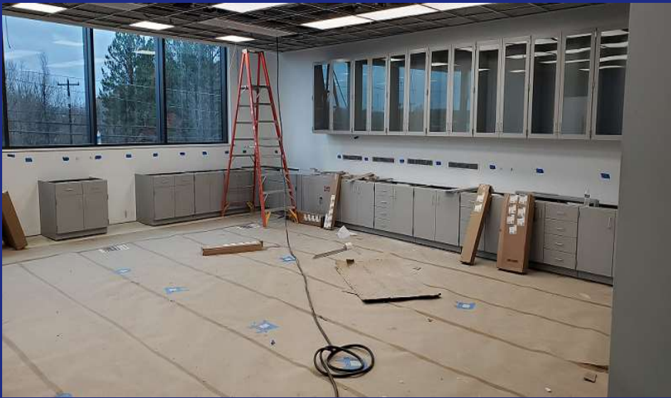
Second floor lab