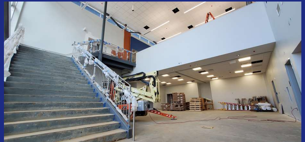
Multipurpose/flex space and stairs to main level