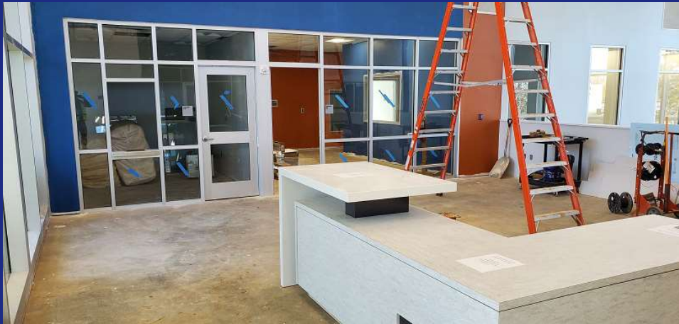
Main Entrance Lobby