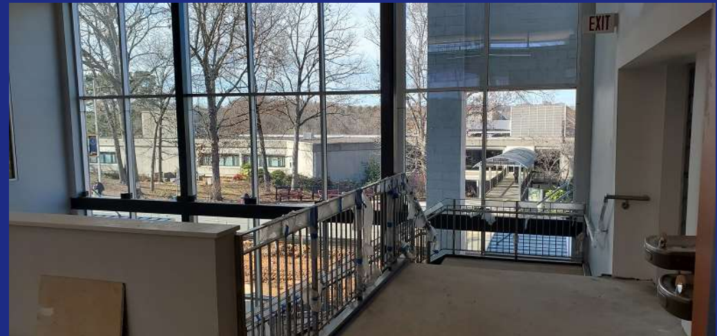
Monumental stairway to lower level