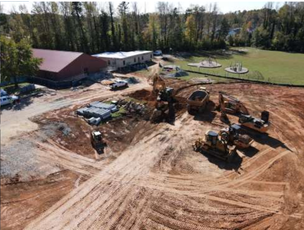
Aerial views of construction: South Mebane Elementary