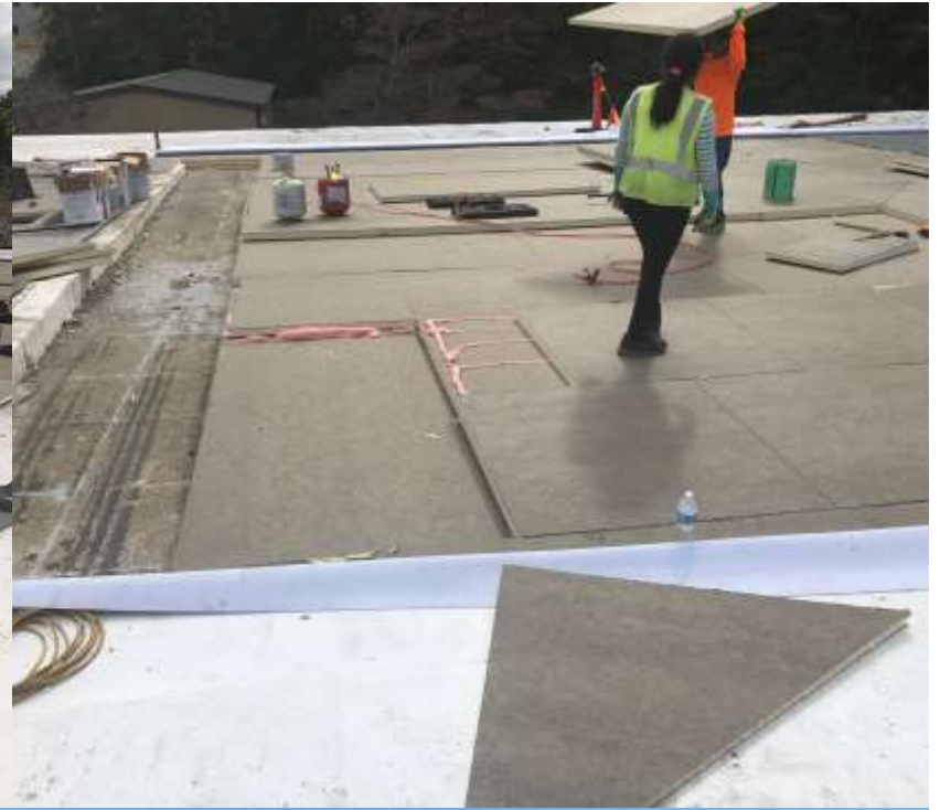
PVC Roof replacement on the K – 2 wing 98% completed as of 11-9-2020