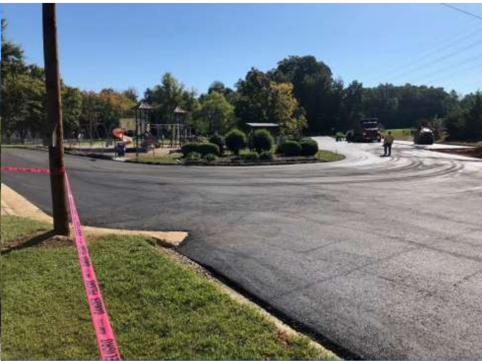
Student drop off and bus parking paved. Currently used for staff parking while construction continues.