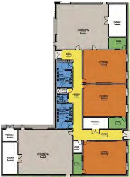
New CTE building